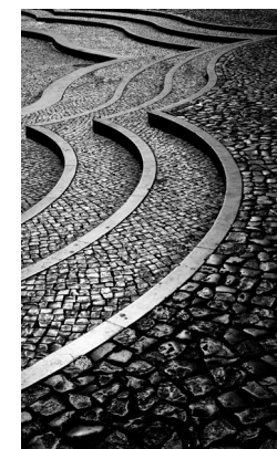
EFLA Image Competition 2010 winner: Ruben Joye - 080824