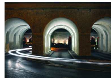
EFLA Image Competition 2011 winner: Silvia Banyoi: Bastion