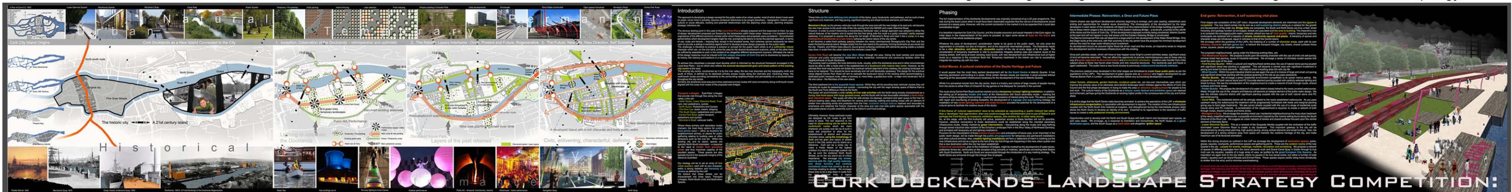
CORK DOCKLANDS LANDSCAPE STRATEGY COMPETITION:

Photography, industrial design, reading, running, swimming, snorkelling, cooking, film, music and anthropology.