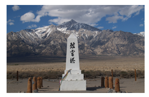
Tour: Manzanar National Historic Site National Park Service