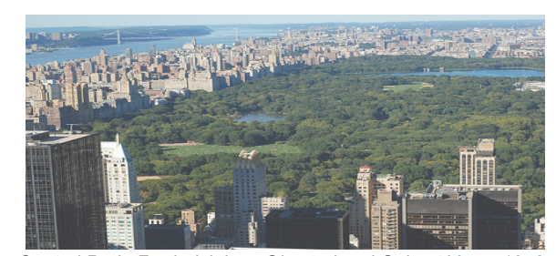
Central Park, Frederick Law Olmsted and Calvert Vaux, 1858