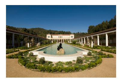
Tour: The Getty Villa