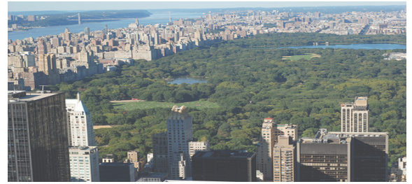
Central Park, Frederick Law Olmsted and Calvert Vaux, 1858