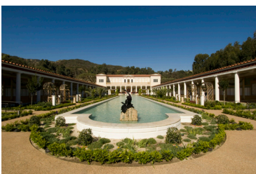
Tour: The Getty Villa