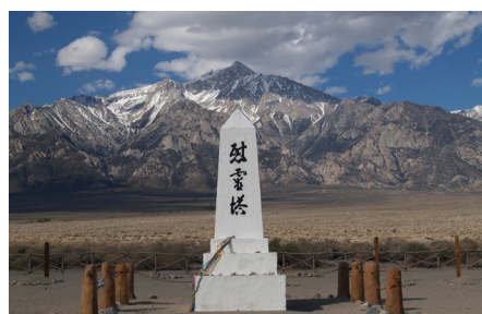
Tour: Manzanar National Historic Site National Park Service