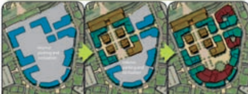
Phasing of Urban Core

Goals: 1) Accommodate local food production 2) Offset peak seasonal land-use by increased density at core 3) Phase density for market by allowing future shift to pedestrian transit zone 4) Promote clean water, reduced energy use, and reduced dependence on cars